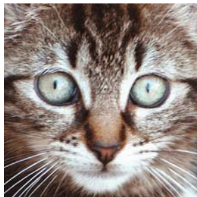
Several weeks later after treatment