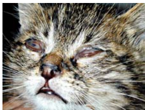
This blinded kitten was found abandoned

Coriza has various symptoms, is highly infectious and spreads rapidly. It can blind a kitten leading to abandonment and death.